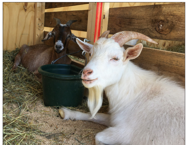
Clark and Snowball were friends before arriving at SFC, and so grateful not to have been separated.