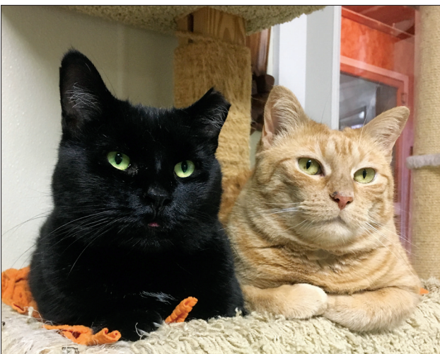
Chester and Meia had each been abandoned, and oh so lonely on arrival. No longer. Their purrs proclaim their happiness and gratitude.