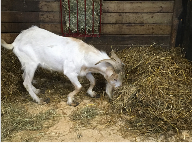
Max, the day he arrived at the farm in May 2020

In May, two goats arrived who were in fairly rough shape. When we watched them arrive, we knew they would need our help. The humans named them Max and Gilligan. They had been through some hard times for sure. But all of us in the barn welcomed them to their new home and we set out to let them know they were safe here.