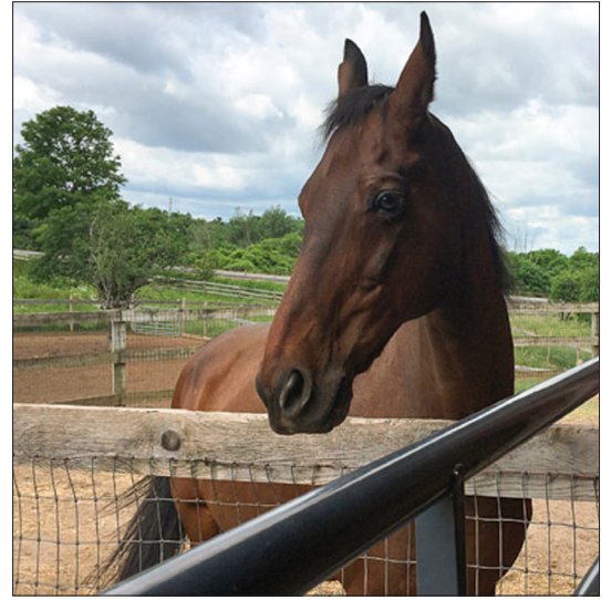
James Bond - "JB"

He came with the name James Bond and we all called him JB. JB was big like me. Well, truth be told he was actually bigger. He had greater accomplishments in life than I ever could have. He was more sophisticated about moving through life. He was wise. He was kind. He was gentle. He walked this earth a little differently than most. His wish when he came here was to be with other horses again. He missed having a horse friend. But JB had also known what it was to be loved his whole life. He radiated a certain light that made me settle within myself. He taught me to be stronger and calmer. And I got to say that I was his friend.