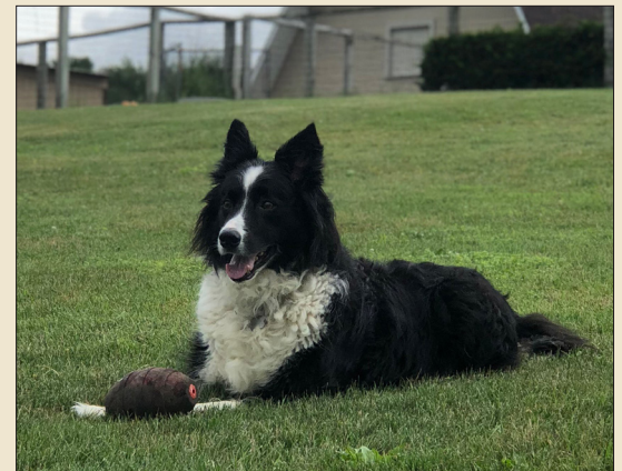
Mack Forever In Our Hearts

Spring Farm CARES will not be taking any more dogs into our sanctuary as we feel we are not able to meet the needs of most dogs with the challenges that bring them in to placement in a sanctuary. That makes Mack's passing seem even larger.