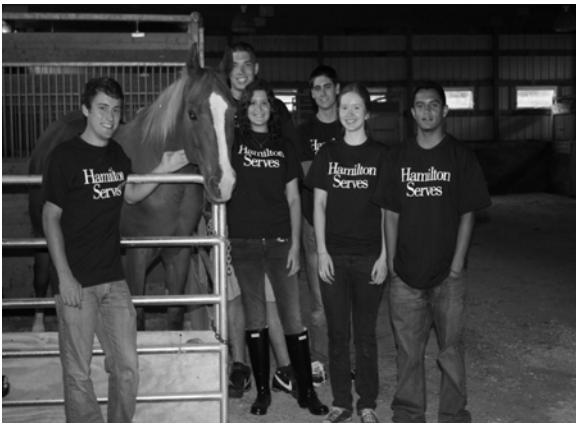
Addie with Hamilton College Volunteers

Hi, I'm Addie and I am the head greeter horse here at the farm. That means that when you come into our barn, I am the one who will first greet you and welcome you. We are so grateful for all of our wonderful volunteers who come and help out with so many tasks and then take time to visit with us too. We try to give back to them as much as they give to us. And we love to have visitors as well. Many times people come who have never been around horses before and have never even touched one. I like to offer my assistance for anyone who wants to give my nose a pat. Kids are always amazed at how big we are and the adults usually say that we feel so soft.